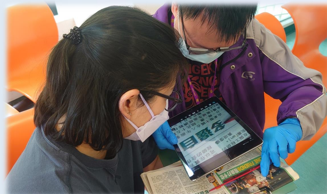
Our Centre assistant is providing demonstrations on how to use assistive apps for visually impaired person